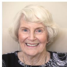
Older woman With partial dentures