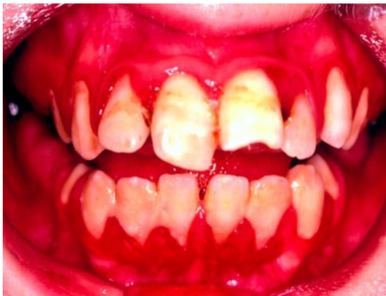
Gum Disease Gingivitis