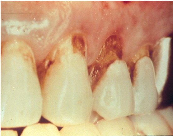
Tooth Decay Caries